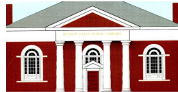
Hudson Falls Free Library